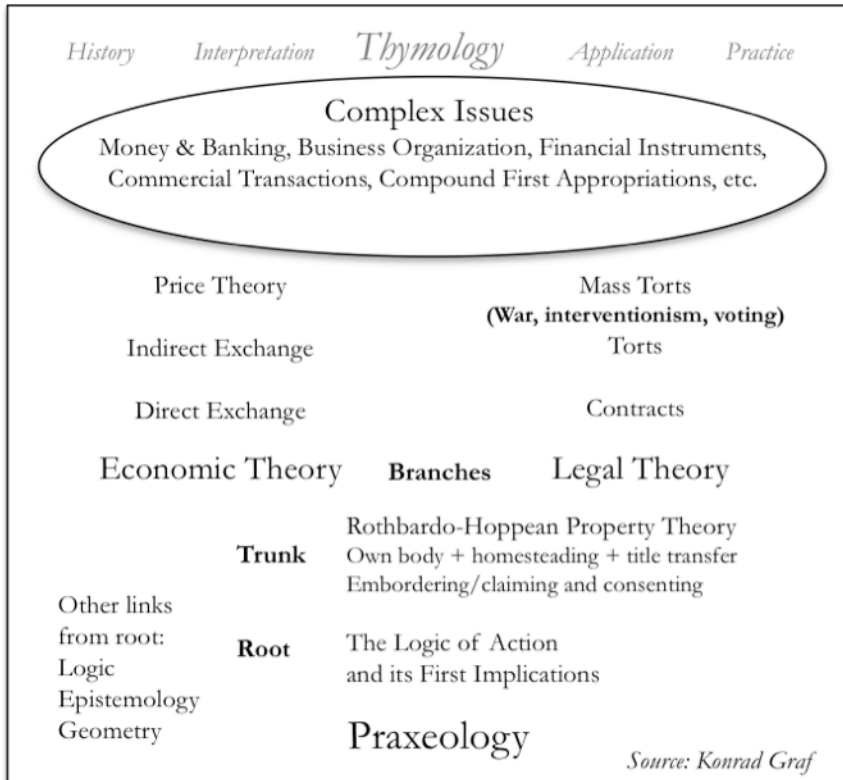
Figure 1. Proposed model of praxeology: Internal structure

To summarize up to this point, using a simple tree metaphor, the root of praxeology can be derived using the analysis of the actions of an isolated individual—the concept of action and its first implications. The trunk comprises the analysis of interaction with classes of communicative acts—embordering/claiming and consenting—and accounts of the concept of first appropriation and the possibility of the consensual transfer of property titles. These concepts are logically prior to branching into economic theory and legal theory because the concepts of both branches logically presuppose some account of the root and trunk foundations, even if this is unacknowledged. The transition into branching may be identified with the move from universal features of all action or interaction to axiomatic deductions that are more narrowly specified with increasing factual or contextual assumptions that assure the relevance of analysis to the parameters of the type of world and context being considered.